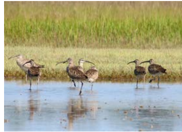
Fowl Play: Sea Island's Birding Adventure ( https://stories.forbestravelguide.com/play-seaislands-birding-adventure )