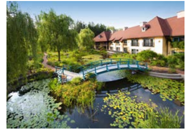
Five Top Lake Summer Getaways ( https://stories.forbestravelguide.com/top-lake-getaways-for-the-summer )