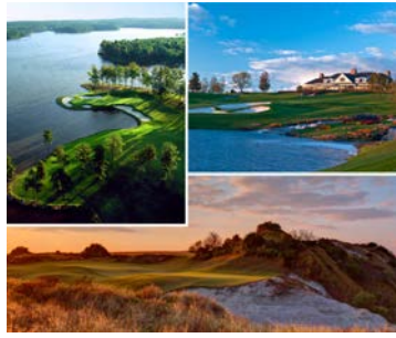
Four Great Golf Resorts You Haven't Visited Yet ( https://stories.forbestravelguide.com/the-best-golf-resorts-youve-never-heard-of )