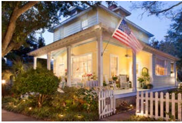
Exploring The South's Best-Kept Island Secret ( https://stories.forbestravelguide.com/exploring-the-souths-best-kept-island-secret )