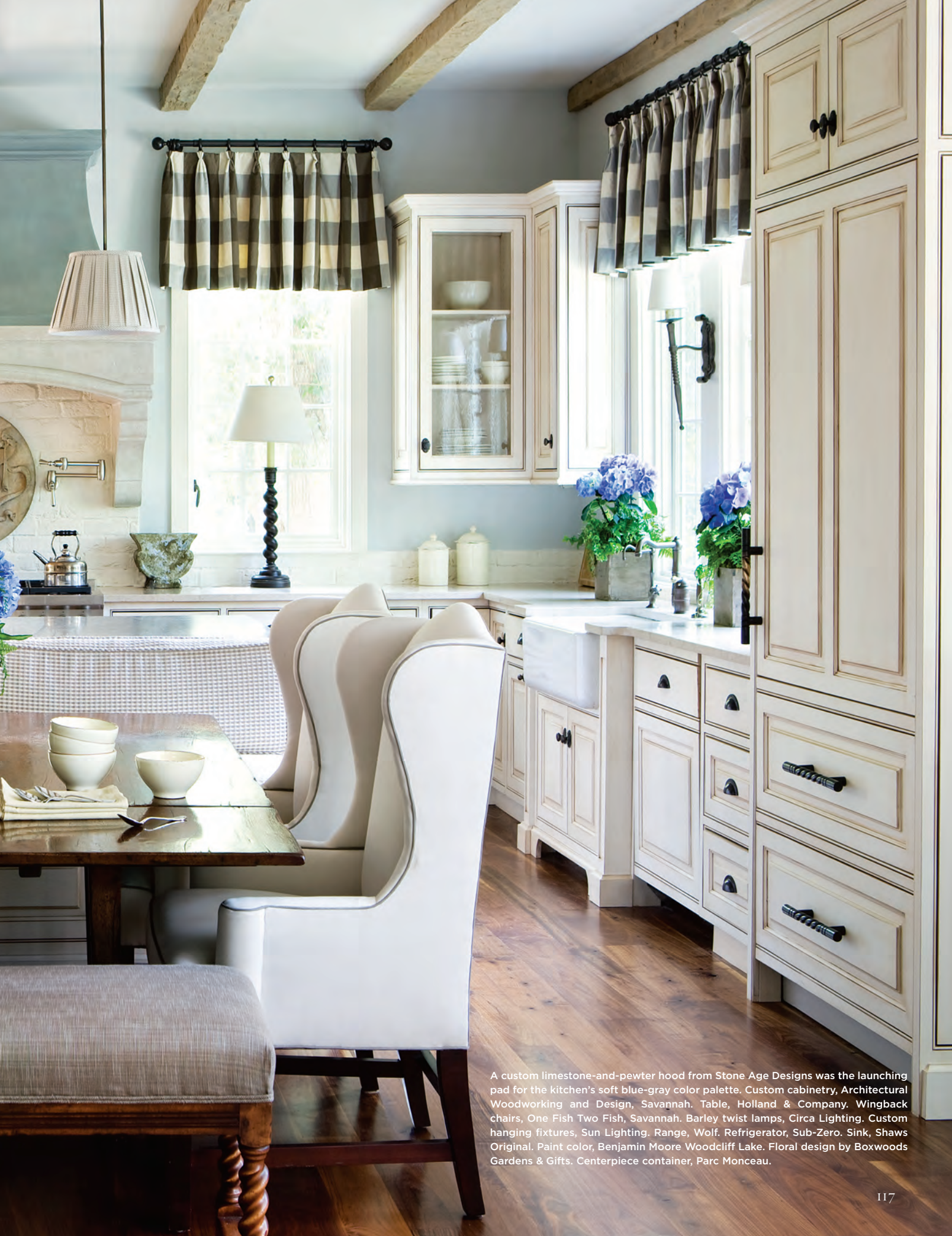
A custom limestone-and-pewter hood from Stone Age Designs was the launching pad for the kitchen's soft blue-gray color palette. Custom cabinetry, Architectural Woodworking and Design, Savannah. Table, Holland & Company. Wingback chairs, One Fish Two Fish, Savannah. Barley twist lamps, Circa Lighting. Custom hanging fixtures, Sun Lighting. Range, Wolf. Refrigerator, Sub-Zero. Sink, Shaws Original. Paint color, Benjamin Moore Woodcliff Lake. Floral design by Boxwoods Gardens & Gifts. Centerpiece container, Parc Monceau.